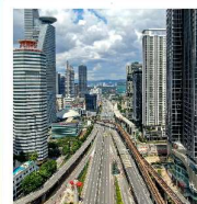
Empty roads during MCO

★ Most of us are aware of the need for social distancing . Lest we forget at the supermarkets, there are lines drawn on the floor and sometimes enforcers as well.